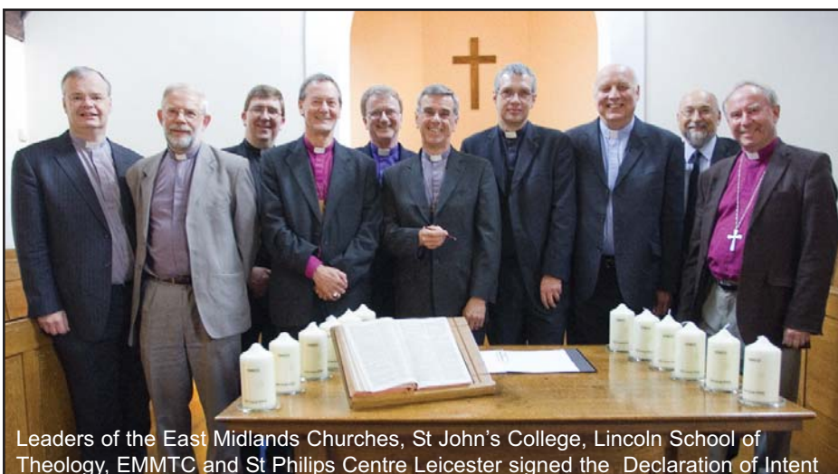
Leaders of the East Midlands Churches, St John's College, Lincoln School of Theology, EMMTC and St Philips Centre Leicester signed the Declaration of Intent